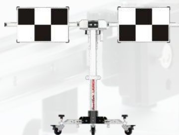
X-431 ADAS Mobile